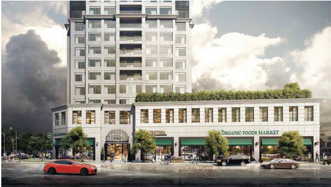
A closer look at the retail area