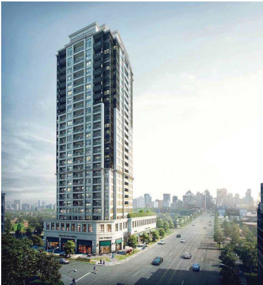
The Vanguard